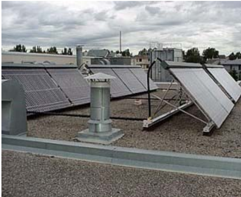
Solar Panels on the Roof of a building in Okotoks / Panneaux solaires sur le toit d'un édifice d'Okotoks http://www.okotoks.ca/sustainable/solar/images/Solarpanelpic.jpg

Ce projet de domestication de l'énergie solaire a valu à Okotoks, un prix des communautés viables de la Fédération canadienne des municipalités en 2006 (Fédération canadienne des municipalités, 2006). Il y a fort à parier que de plus en plus de municipalités adopteront des initiatives semblables au cours des prochaines années.